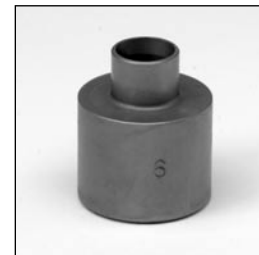
Fig. S98 — Body Die