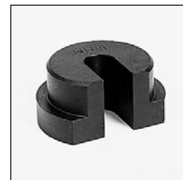
Fig. S99 — Nut Die

Dimensions and pressures for reference only, subject to change.